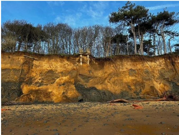
Cliff erosion below A site showing radar foundations