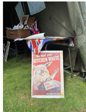
1940s tea at the radar block