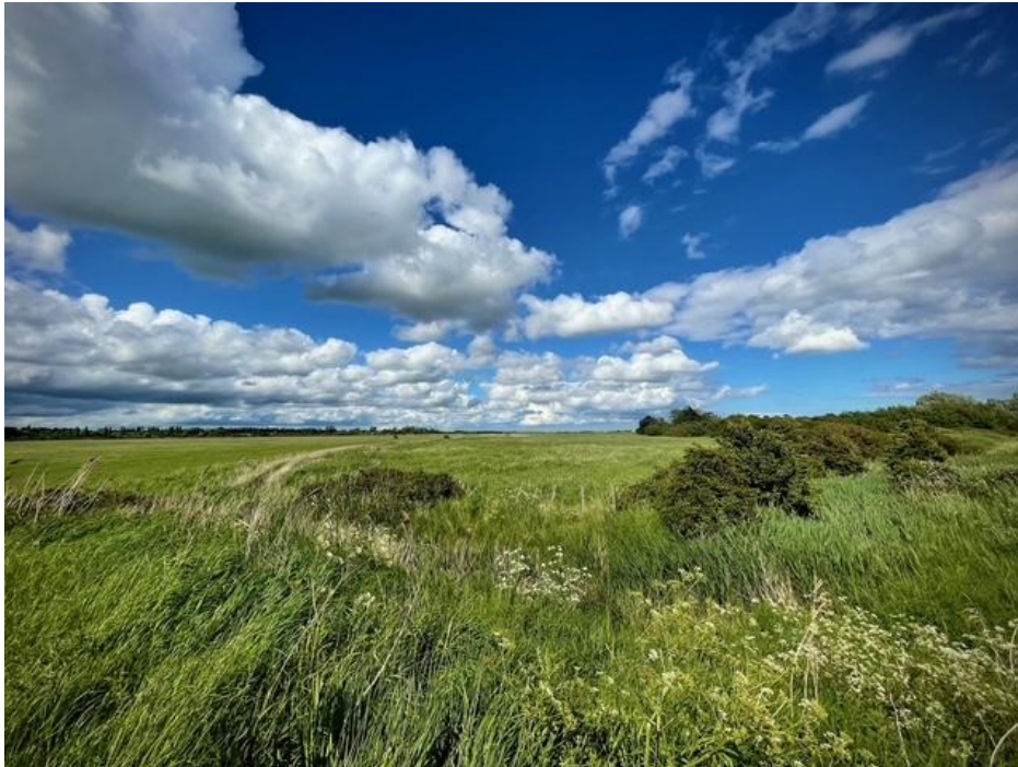
The rewilding at Shingle Street Marshes