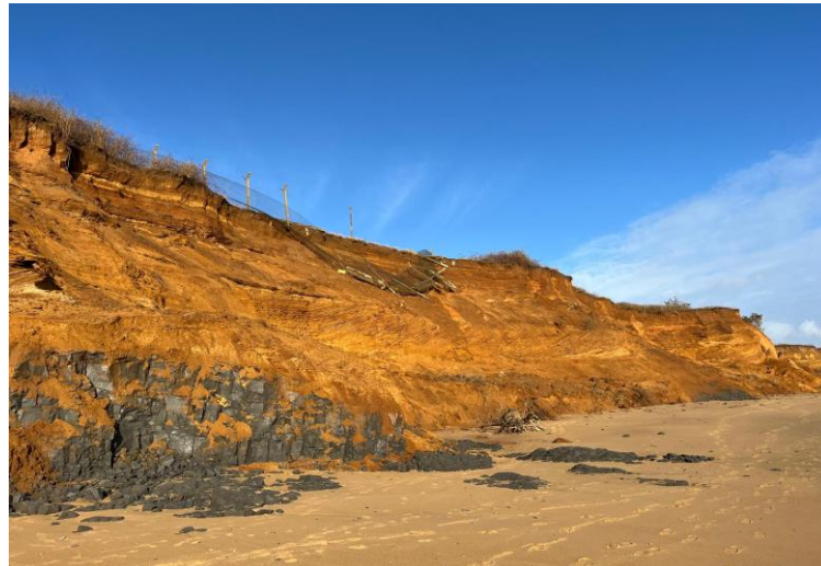
The perimeter fence of the Cold War site down the cliff