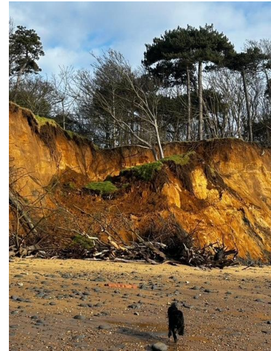
A few more trees topple over