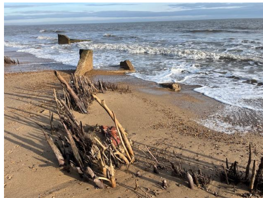
Low tide revealing early revetment sea defences and WW2 pill box