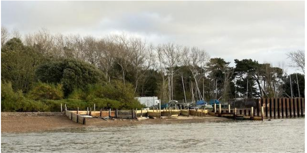
Temporary repairs to the area in front of Bawdsey Hove Yacht Club and the coastal footpath