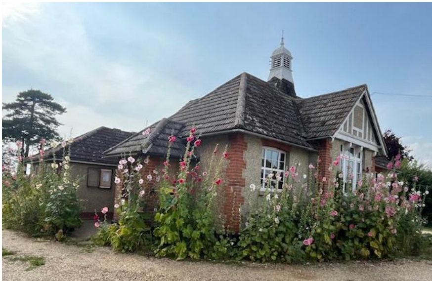
Hollyhocks in July