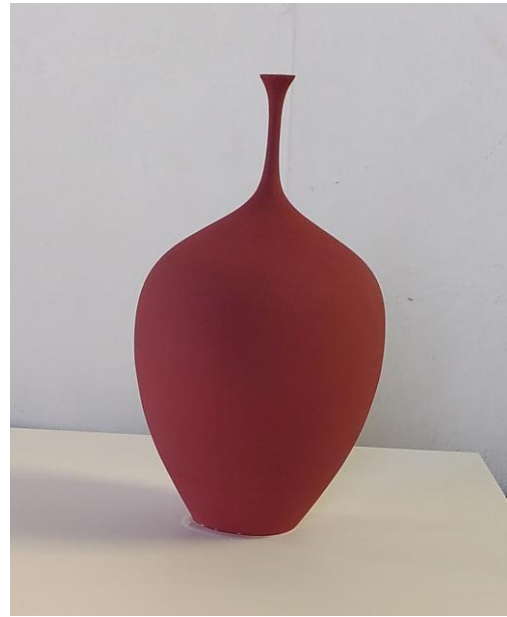
Teardrop Bottle by Sophie Cook