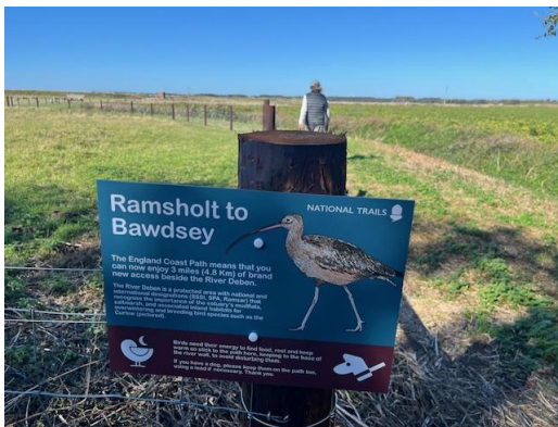
New sign promoting the King Charles III coastal footpath