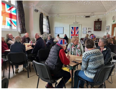
Bawdsey Village Hall spread